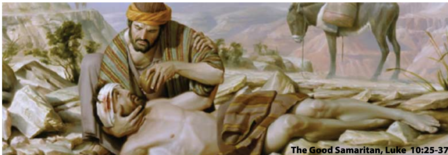
The Good Samaritan, Luke 10:25-37